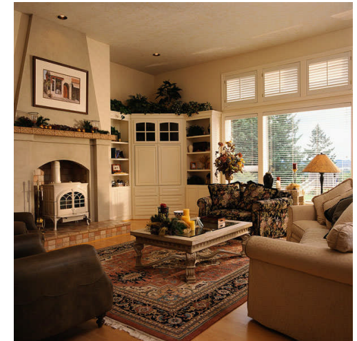
Family Room with Wood Burning Fireplace