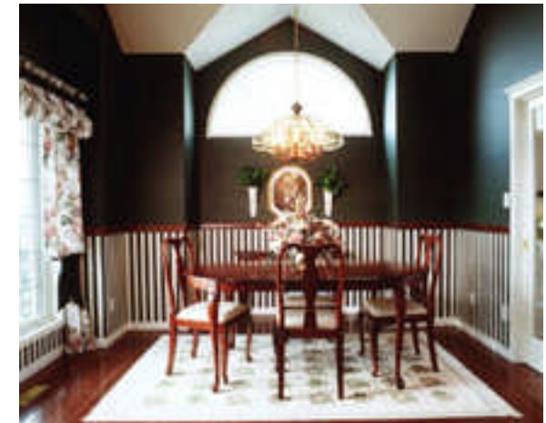
Enjoy Meals at the Family Dining Table